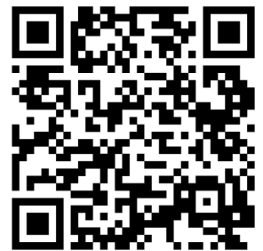
Team Tyler Page