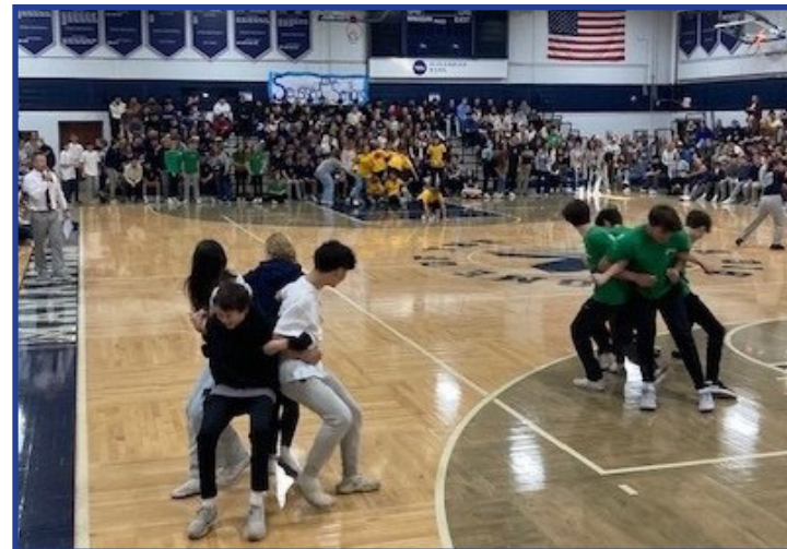
Above: Octopus Race in action; below: MHS band brings the energy

After the video, the first event of the Pep Rally started, the relay race! Each grade races one another in multiple different ways. The types of races included a scooter race, leapfrog race, 3-legged race, cartwheel race, and a new octopus race, which