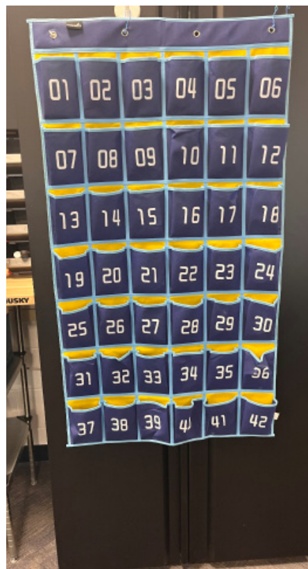
Above: a cell phone caddy where phones are placed at the start of class. Some students call it "phone jail".