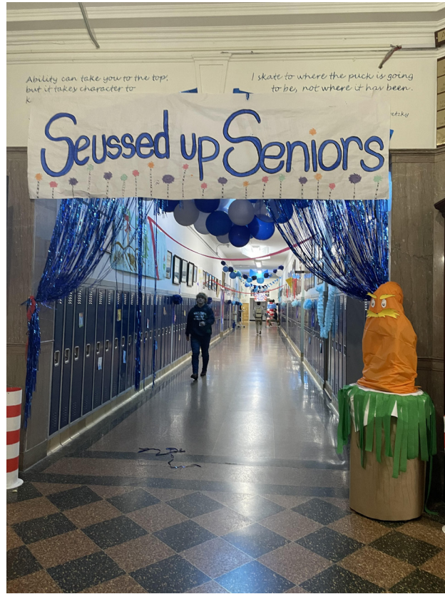
ABOVE: The entrance to the senior hallway.

their designated hallway accordingly. At the end of the day, a winner is decided by the teachers.