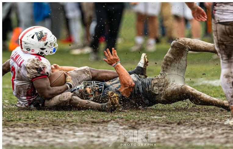
Above: Manasquan player covered in mud after being tackled

All the struggles, tiring practices and long film sessions paid off for this team. This win was a great ending for