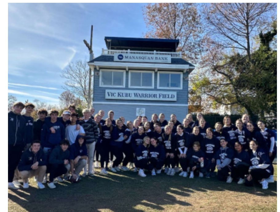
Above: The Junior powder puff team and football players who coached them.

The Powder Puff game brings together students to celebrate the spirit of competition, teamwork, and school pride. Unlike the typical high school football game, Powder Puff allows the junior and senior girls to showcase their athleticism and sportsmanship in a friendly but competitive environment.