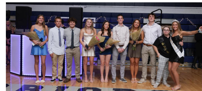
Above: King and Queen and Homecoming Court Below: Yearbook Staff and "Shark Head" donated by the Art Club