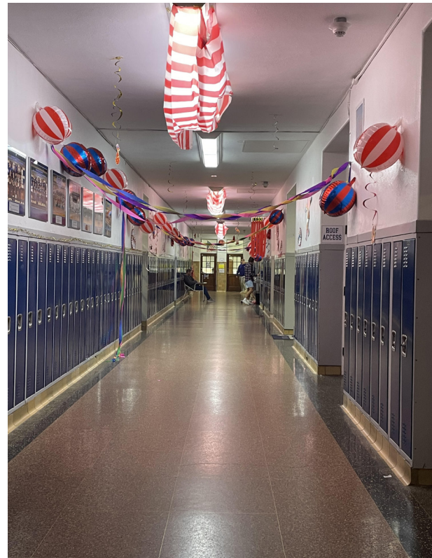
BELOW: The entrance to the freshman hall

and they even had a cardboard cutout of Elvis Presley standing near the entrance to the cafeteria. One side of their hallway was adorned with many golden balloons, framing the arched entryway. This class's dedication was rewarded at the end of the day when they ended up winning the competition.