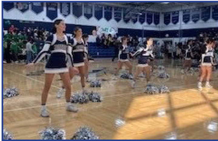
Above: Cheerleaders Performing at the Pep Rally

Unlike the usual days in Manasquan High School, that are spent in classrooms learning algebra or history, on Wednesday, November 26, students gathered in the gymnasium to watch and/or participate in the annual Pep Rally.