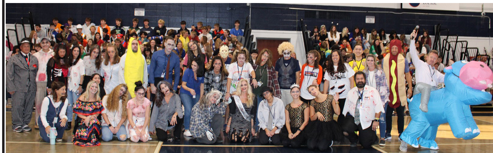
Above: MHS teachers dressed as zombies, and performed a special rendition of Michael Jackson's "Thriller"