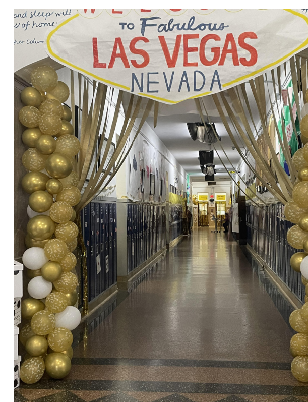
BELOW: The entrance to the junior hallway.

All in all, Spirit Week at Manasquan High School was a festivity filled time for the students with multiple events and activities. The annual hallway competition was as anticipated as ever, and everyone enjoyed looking at all the designs. Despite effort from every grade, the Junior class took the crown for "best decorated" with their theme "Jackpot Juniors". It's safe to say we can't wait to see how creative the students will be next year!