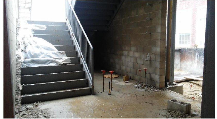
Stair "A" structure in place