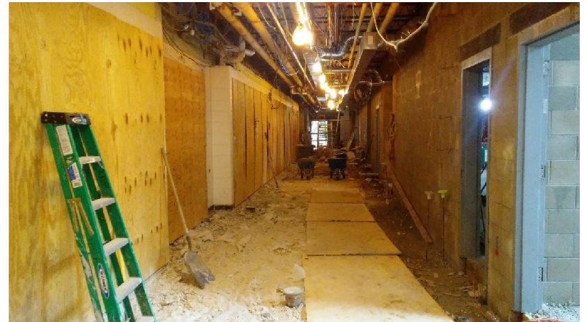
Main first floor corridor - terrazzo flooring demo