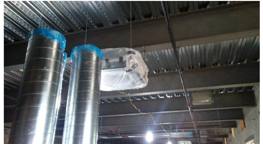
First floor science room