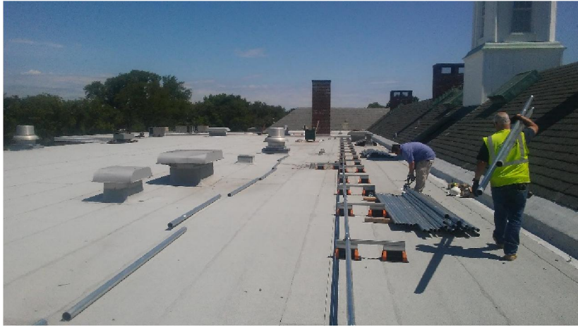
Conduit installation (power feeds from MDP-2)