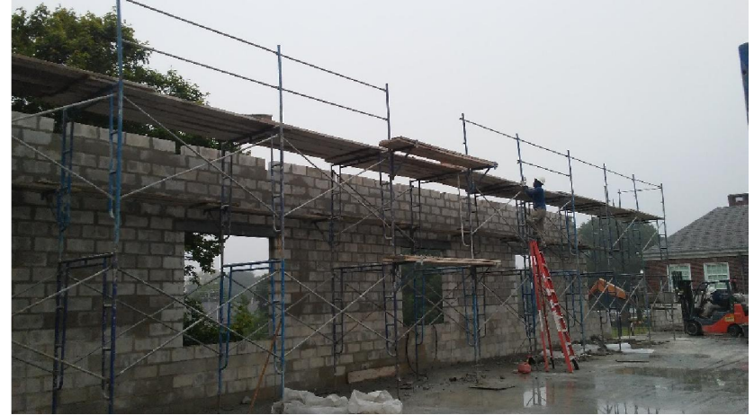
Second floor CMU masonry (east wall) in progress