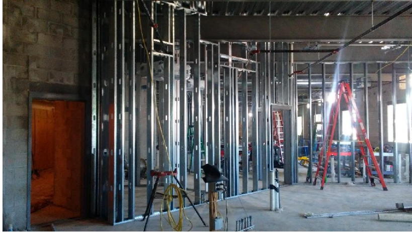
First floor interior framing