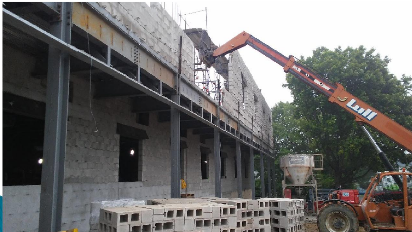
East elevation of addition