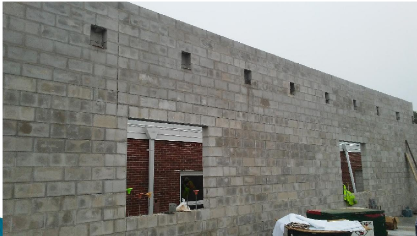
Second floor CMU (west wall)