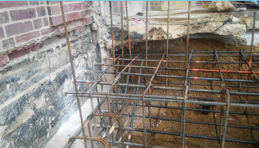
Main grade beam connected to 1931 building foundation