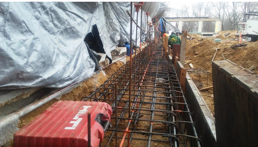
Main corridor grade beam rebar