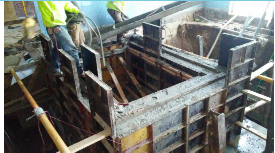
Elevator pit walls being poured