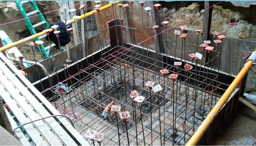
HS Elevator Pit footing rebar