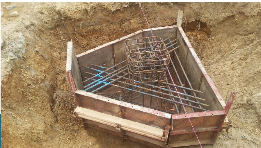
Typical pile cap rebar