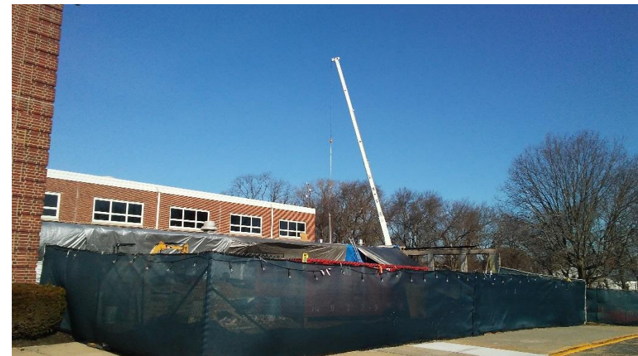
Crane setting structural steel columns