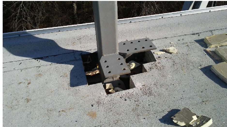
Steel connection through roof of music room