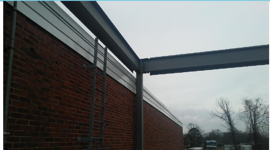
Structural steel (at addition)