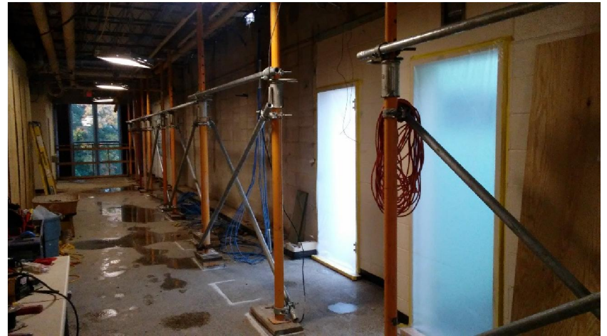
Temp shoring at gym corridor