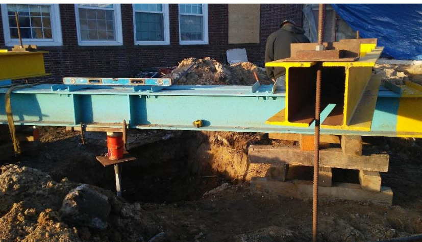
Helical Pile Test Apparatus