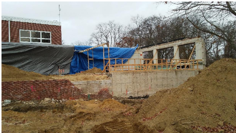
East Foundation wall (at classroom 306)