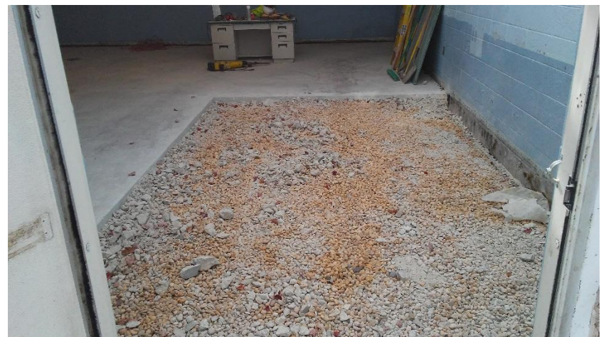
Slab removal in classroom 002