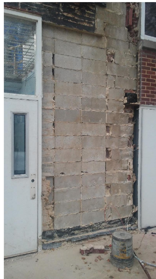
Ground floor wall at CR 002