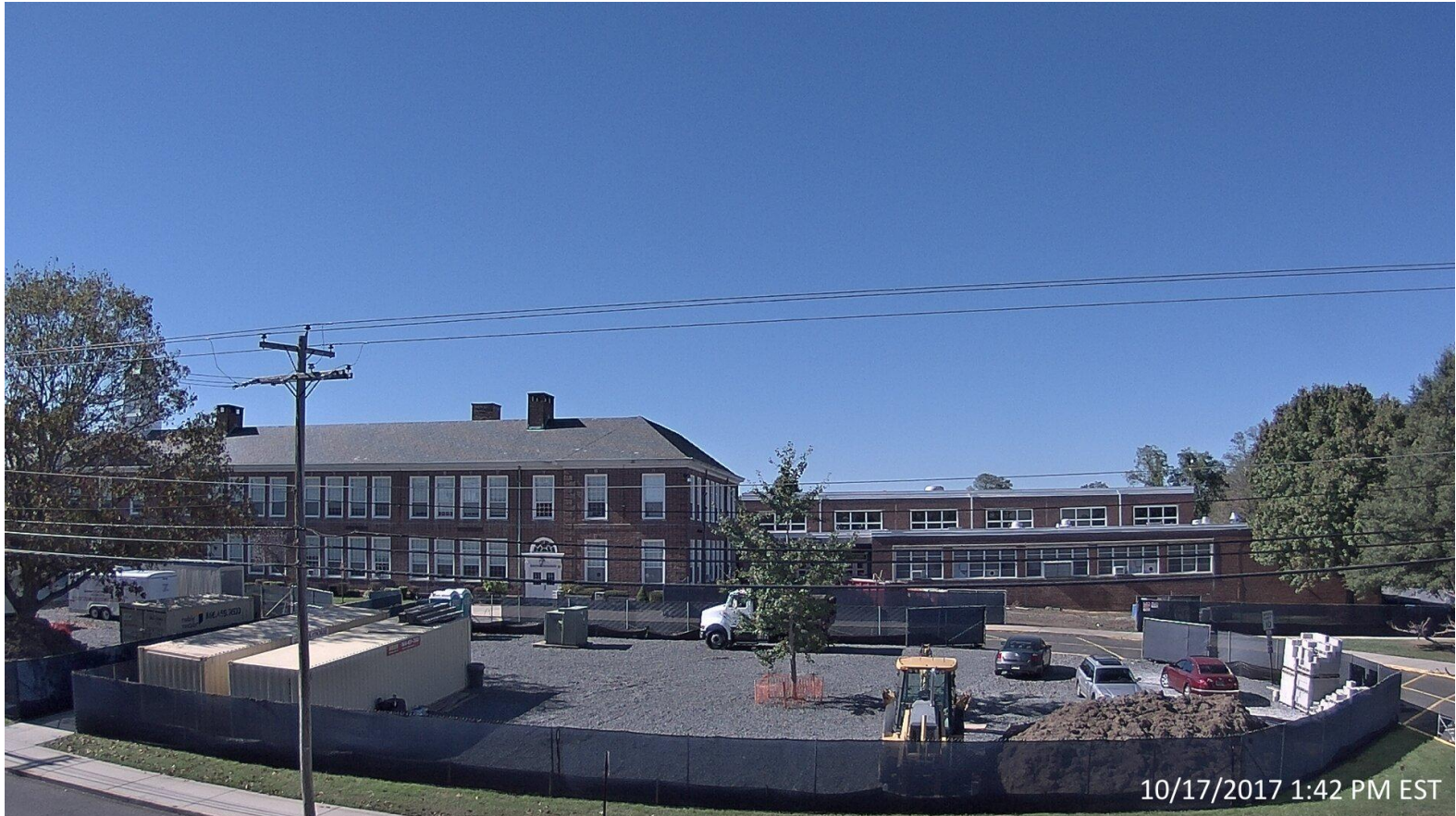
View of High School from Construction Camera